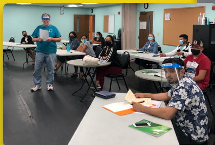
Level 3 ESL Class