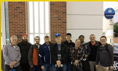
Belize 2020 Team

WEAG is committed to the work of the Great Commission, which Christ gave His disciples (Matthew 28:19-20). We believe in practically meeting the physical, social and spiritual needs of the peoples we meet, using project opportunities to share the gospel and "make disciples of the nations."