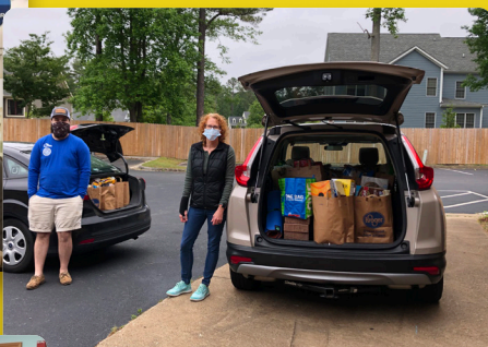
Spring Food Distribution