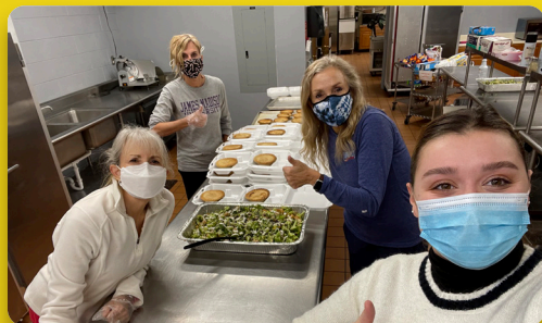
Friends of the Homeless team