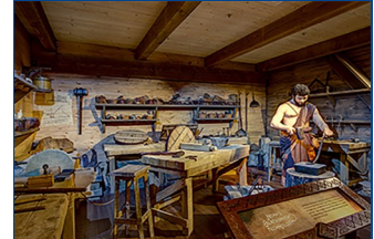
View from Inside the Ark Encounter