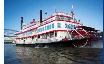
Enjoy a BB Riverboats Sightseeing Cruise