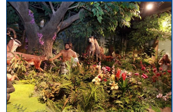
Visit to the Amazing Creation Museum!